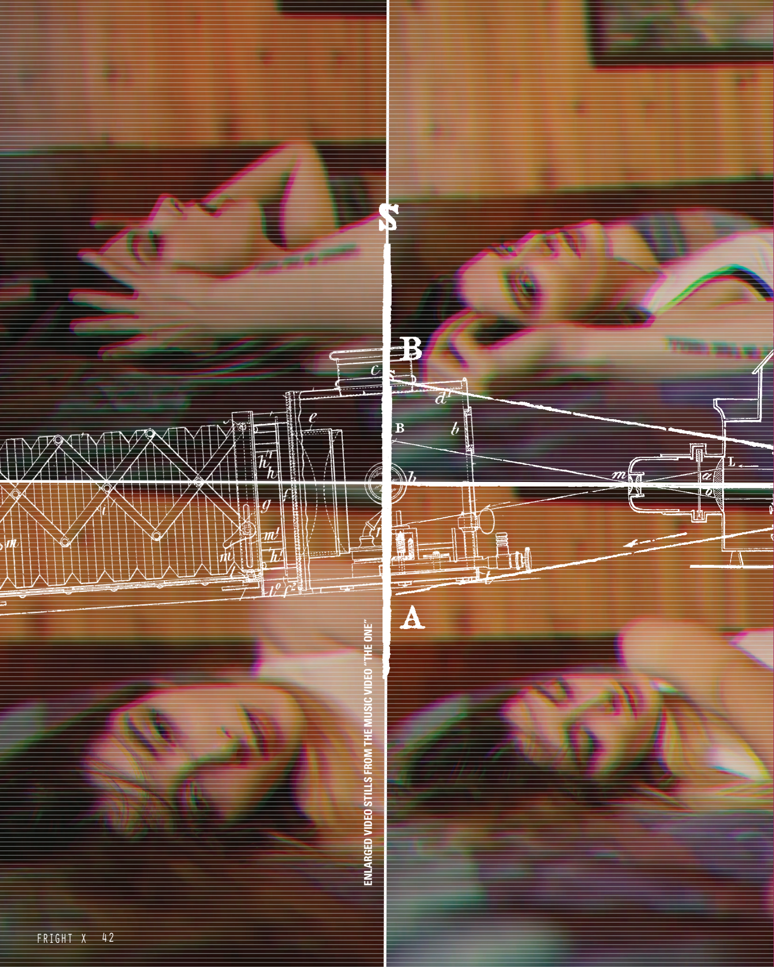
ENLARGED VIDEO STILL FROM THE MUSIC VIDEO "THE ONE"